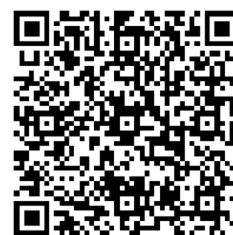
Sealant / Adhesive link