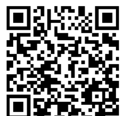
Applicator video link