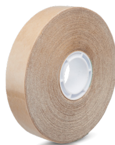
Double sided tape

The dispenser easily applies double-sided tape for bonding whilst automatically stripping the liner. For easy installation of T-FIT sheets, the dispenser applies exposed tape to the foam sheet, allowing the insulation sheet to be directly applied to the tank/vessel surface.